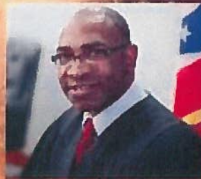
Honorable Judge Fanon A. Rucker Municipal Court